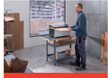
Throughput up to 110 lbs/h